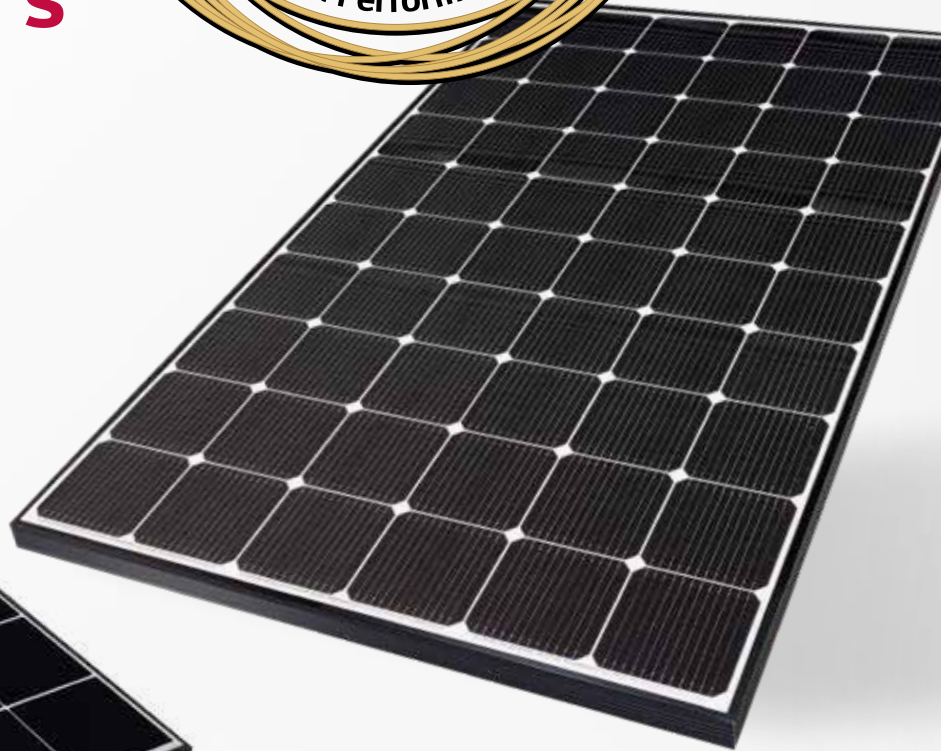
LG NeON ® 2