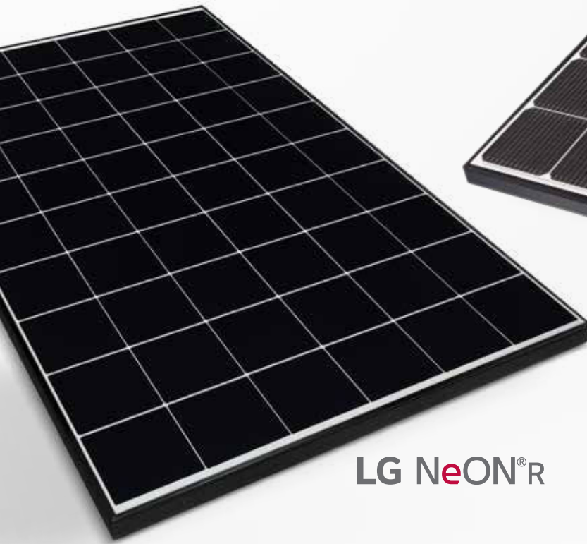
LG NeON ® R